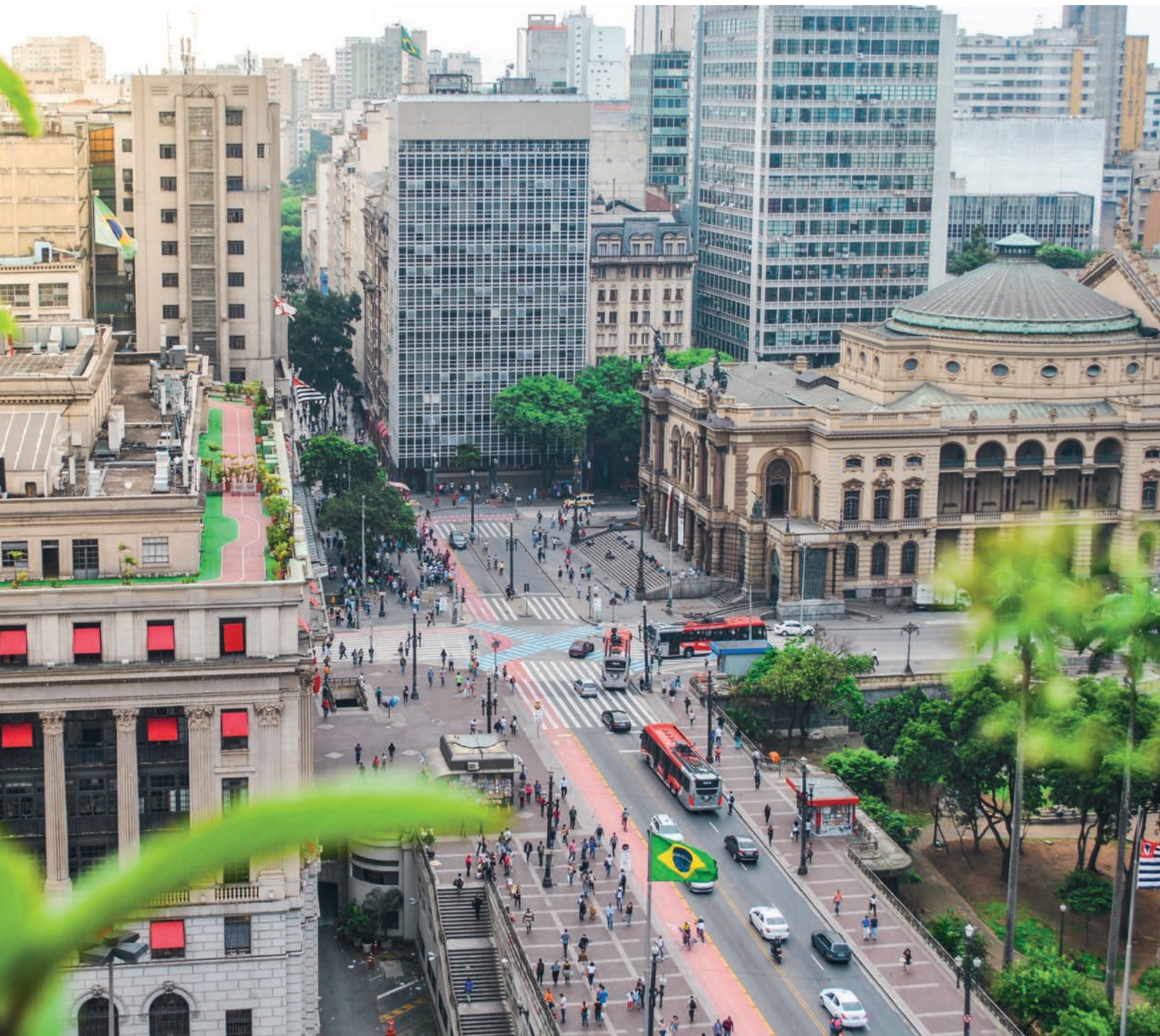
Municipal Theater and historical city center